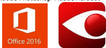
Microsoft Office Abbyy Finereader