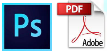
Adobe Photoshop Adobe Acrobat