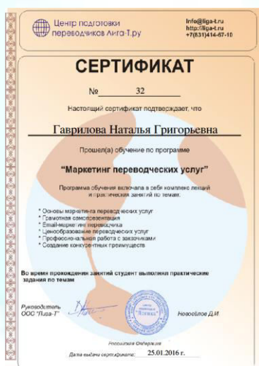
Translation Services Marketing course completion certificate