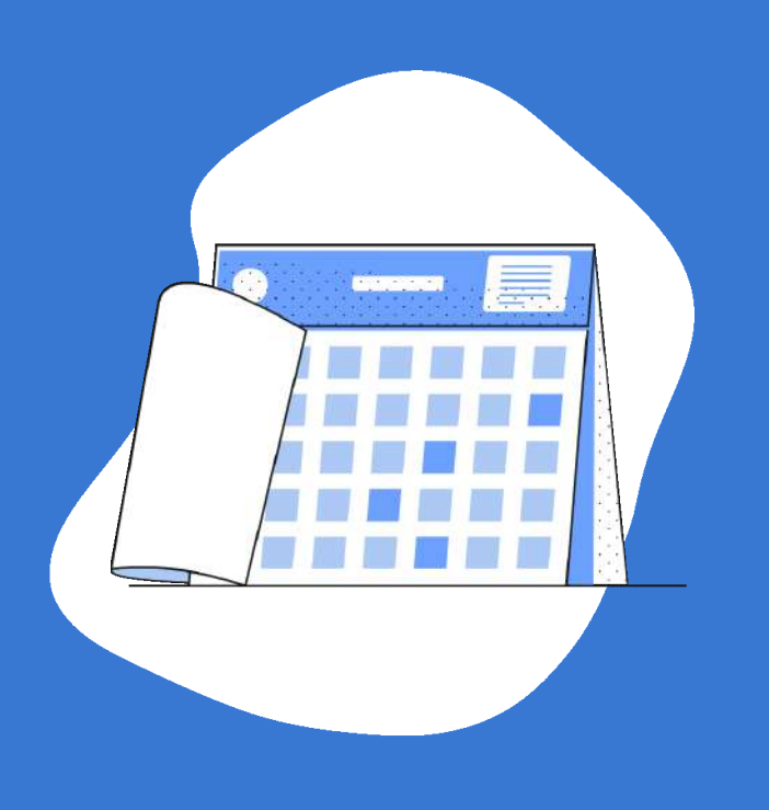
We accept extra urgent projects