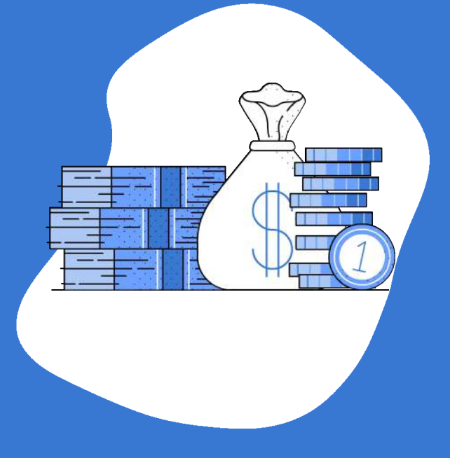
We save your budget by 17%