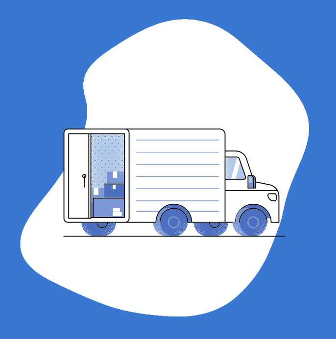
Delivery at our cost and expense