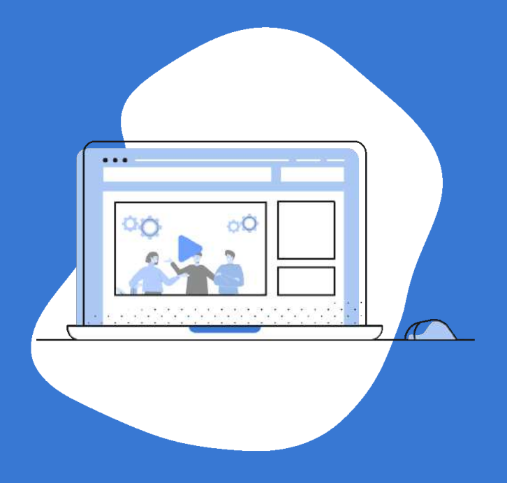
We find solutions for complex projects